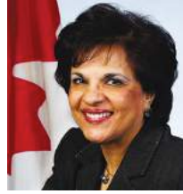
"From Refugee to Senate" Mobina Jaffer, Canadian Senate