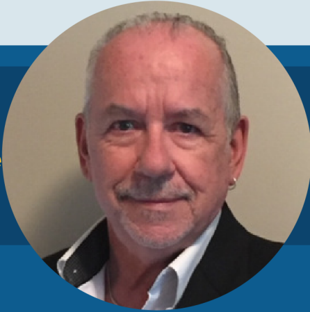
CAGFO Executive Director